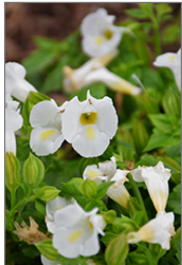
Catalina White Linen Torenia flowers