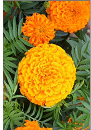
Taishan Orange Marigold flowers