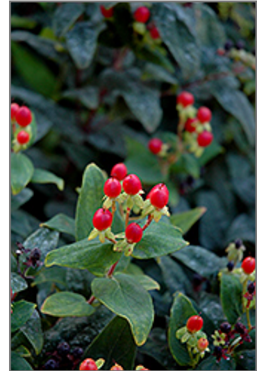
Ignite Red St. John's Wort fruit