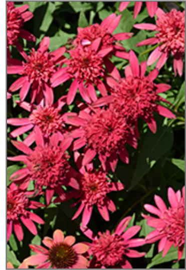
Double Scoop Raspberry Coneflower flowers