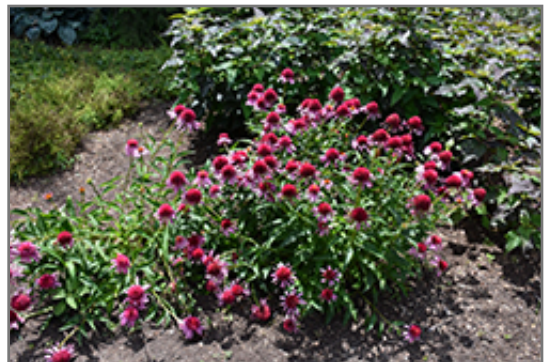
Double Scoop Bubble Gum Coneflower in bloom