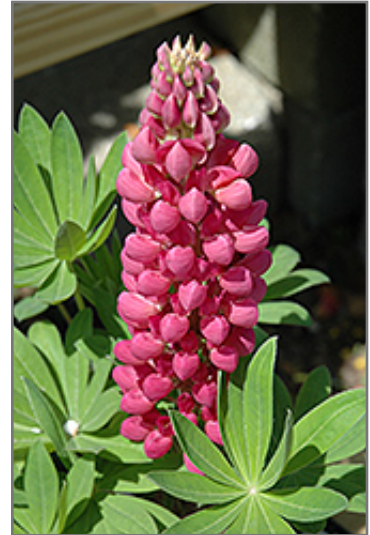
Minarette Mix Lupine flowers