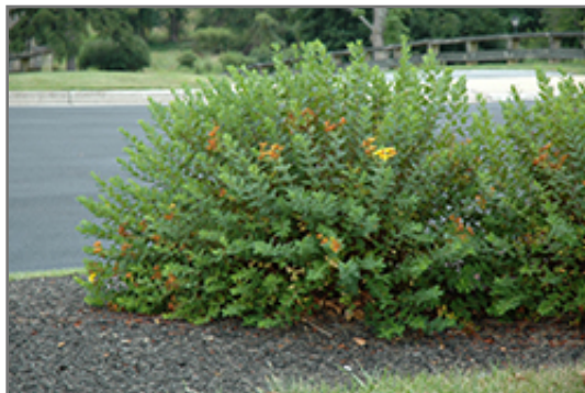
Hidcote St. John's Wort

Hidcote St. John's Wort makes a fine choice for the outdoor landscape, but it is also well-suited for use in outdoor pots and containers. With its upright habit of growth, it is best suited for use as a 'thriller' in the 'spiller-thriller-filler' container combination; plant it near the center of the pot, surrounded by smaller plants and those that spill over the edges. It is even sizeable enough that it can be grown alone in a suitable container. Note that when grown in a container, it may not perform exactly as indicated on the tag - this is to be expected. Also note that when growing plants in outdoor containers and baskets, they may require more frequent waterings than they would in the yard or garden.