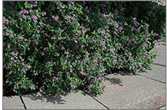
Leptodermis in bloom

This shrub does best in full sun to partial shade. It prefers to grow in average to moist conditions, and shouldn't be allowed to dry out. It is not particular as to soil type or pH. It is somewhat tolerant of urban pollution. This species is not originally from North America.