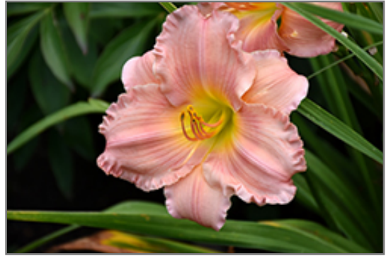
Jolyene Nichole Daylily flowers