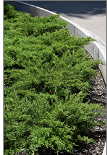
Broadmoor Juniper