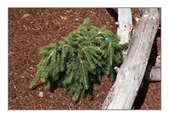
Formanek Norway Spruce