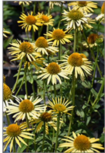
Maui Sunshine Coneflower flowers