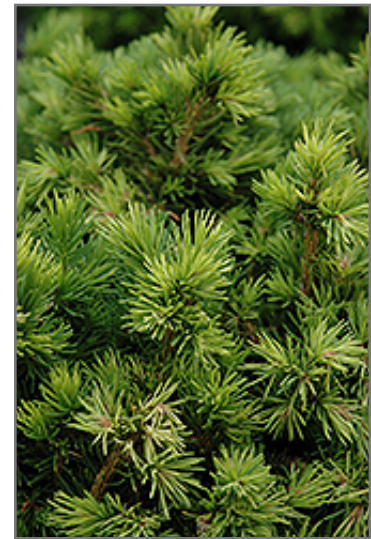
Tompa Dwarf Spruce foliage