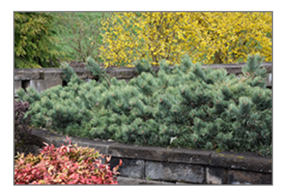
Albyn Prostrate Scotch Pine