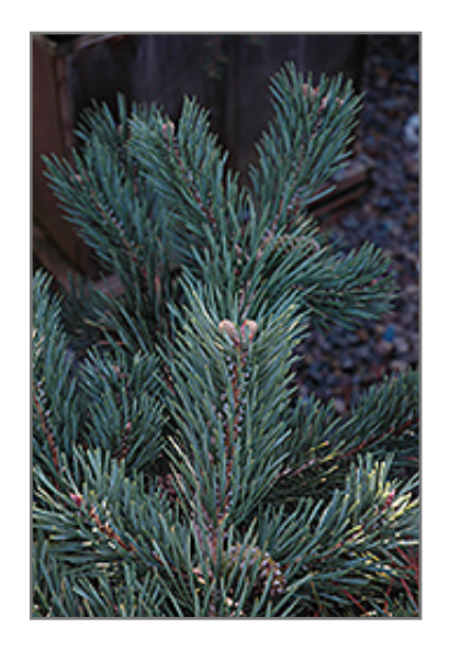
Albyn Prostrate Scotch Pine foliage