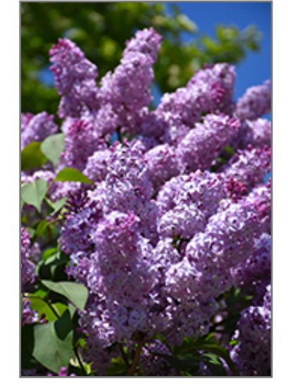
Common Lilac flowers