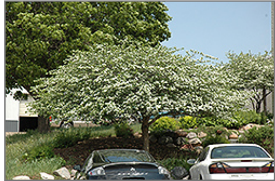
Thornless Cockspur Hawthorn in bloom