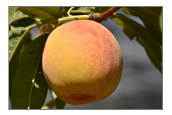
Reliance Peach fruit

Reliance Peach is clothed in stunning clusters of fragrant pink flowers along the branches in early spring, which emerge from distinctive rose flower buds before the leaves. It has dark green deciduous foliage. The narrow leaves turn yellow in fall. The fruits are showy yellow drupes with a red blush, which are carried in abundance in mid summer. The fruit can be messy if allowed to drop on the lawn or walkways, and may require occasional clean-up.