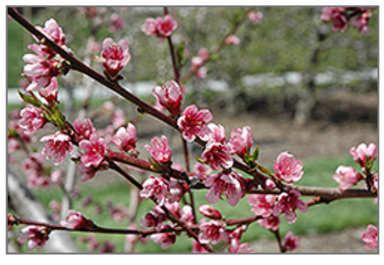
Reliance Peach flowers