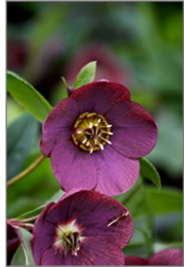
Honeymoon Rome In Red Hellebore flowers

Honeymoon Rome In Red Hellebore is recommended for the following landscape applications;