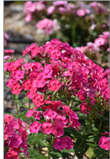
Ka-Pow Pink Garden Phlox flowers

Ka-Pow Pink Garden Phlox is recommended for the following landscape applications;