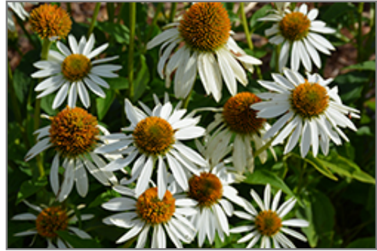
Happy Star Coneflower flowers

Happy Star Coneflower is recommended for the following landscape applications;