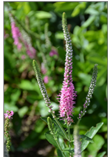
Perfectly Picasso Speedwell flowers