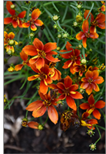
Sizzle And Spice Crazy Cayenne Tickseed flowers

Sizzle And Spice Crazy Cayenne Tickseed is recommended for the following landscape applications;