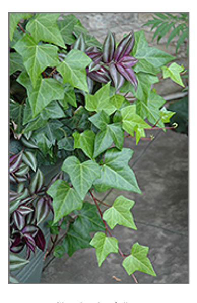
Algerian Ivy foliage

When grown indoors, Algerian Ivy can be expected to grow to be about 10 feet tall at maturity, with a spread of 3 feet. It grows at a fast rate, and under ideal conditions can be expected to live for approximately 30 years. This houseplant performs well in both bright or indirect sunlight and strong artificial light, and can therefore be situated in almost any well-lit room or location. It is very adaptable to both dry and moist soil, and should do just fine under average home conditions. The surface of the soil shouldn't be allowed to dry out completely, and so you should expect to water this plant once and possibly even twice each week. Be aware that your particular watering schedule may vary depending on its location in the room, the pot size, plant size and other conditions; if in doubt, ask one of our experts in the store for advice. It is not particular as to soil pH, but grows best in rich soil. Contact the store for specific recommendations on pre-mixed potting soil for this plant. Be warned that parts of this plant are known to be toxic to humans and animals, so special care should be exercised if growing it around children and pets.