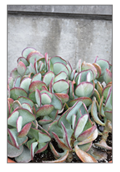
Silver Dollar Plant