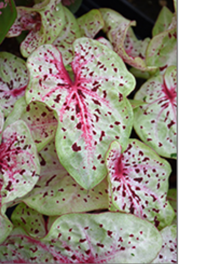
Miss Muffet Caladium foliage

When grown indoors, Miss Muffet Caladium can be expected to grow to be about 12 inches tall at maturity, with a spread of 14 inches. It grows at a medium rate, and under ideal conditions can be expected to live for approximately 10 years. This houseplant performs well in both bright or indirect sunlight and strong artificial light, and can therefore be situated in almost any well-lit room or location. It prefers to grow in average to moist soil. The surface of the soil shouldn't be allowed to dry out completely, and so you should expect to water this plant once and possibly even twice each week. Be aware that your particular watering schedule may vary depending on its location in the room, the pot size, plant size and other conditions; if in doubt, ask one of our experts in the store for advice. It is not particular as to soil type or pH; an average potting soil should work just fine.