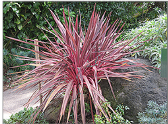
Electric Pink Cordyline

Electric Pink Cordyline is recommended for the following landscape applications;