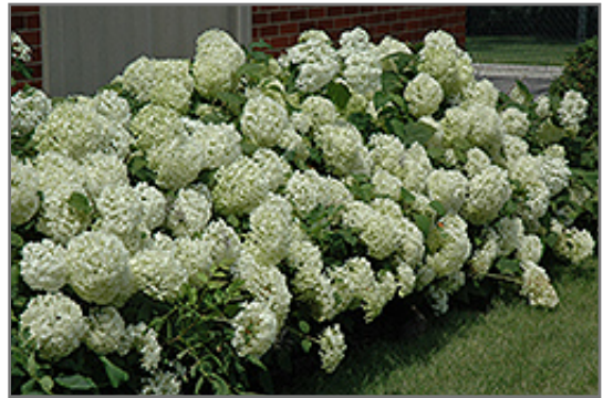
Annabelle Hydrangea in bloom