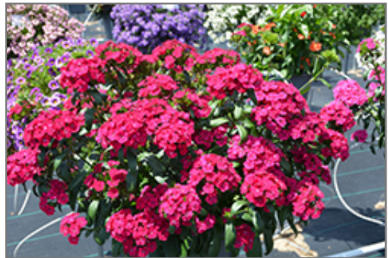
Jolt Cherry Hybrid Pinks in bloom