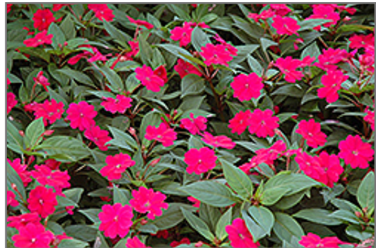
Bounce Cherry Impatiens in bloom