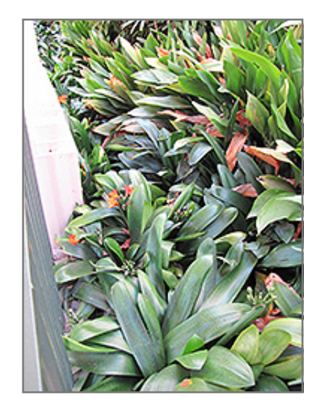
Belgian Hybrid Orange Clivia