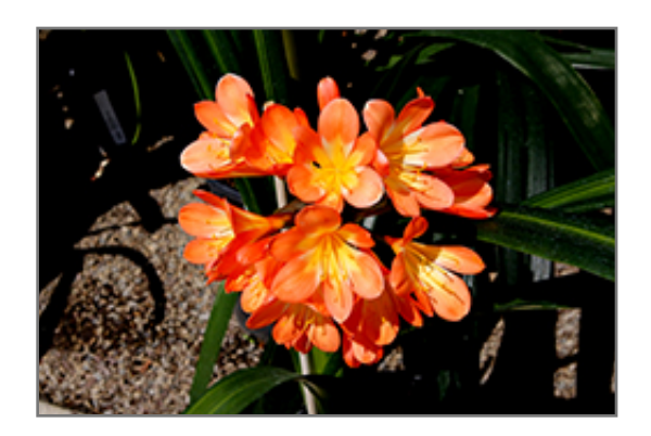
Belgian Hybrid Orange Clivia flowers