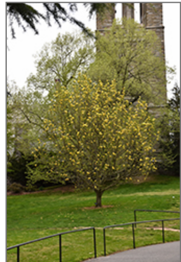
Judy Zuk Magnolia in bloom