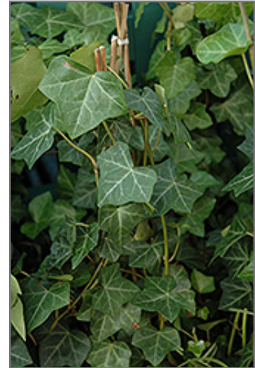
Thorndale Ivy foliage