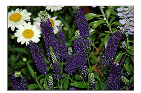
Vernique Dark Blue Speedwell flowers

2701 Cumming Avenue Cumming, IA 50061 phone: 515-981-1073 web: www.tedsgardens.com