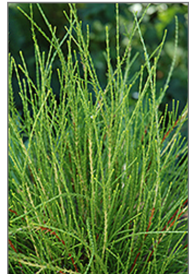
Franky Boy Arborvitae foliage