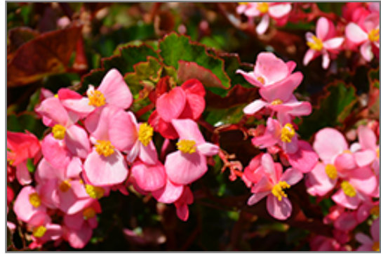
BabyWing Pink Begonia flowers