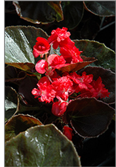
Doublet Red Begonia flowers