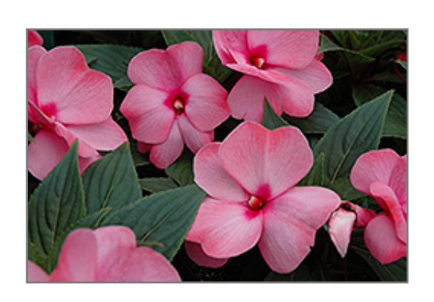
Celebrette Appleblossom New Guinea Impatiens flowers

Celebrette Appleblossom New Guinea Impatiens is recommended for the following landscape applications;