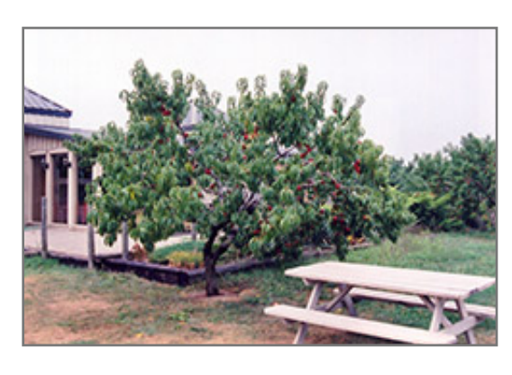
Hardired Nectarine