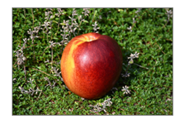
Hardired Nectarine fruit

Hardired Nectarine is blanketed in stunning clusters of fragrant pink flowers along the branches in early spring, which emerge from distinctive rose flower buds before the leaves. It has dark green deciduous foliage. The narrow leaves turn yellow in fall. The fruits are showy scarlet drupes with hints of yellow, which are carried in abundance in mid summer. The fruit can be messy if allowed to drop on the lawn or walkways, and may require occasional clean-up.