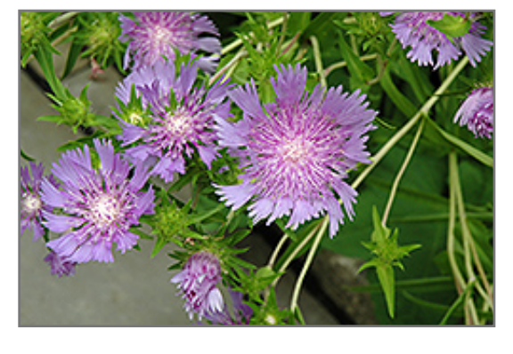
Stoke's Aster flowers