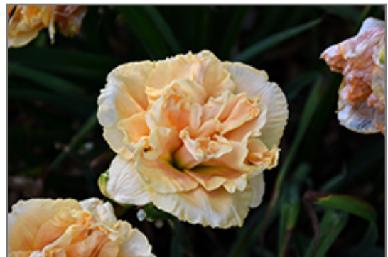
Rainbow Rhythm Siloam Peony Display Daylily flowers