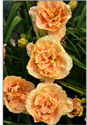
Rainbow Rhythm Siloam Peony Display Daylily flowers