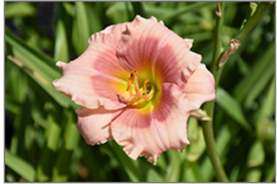
Janice Brown Daylily flowers