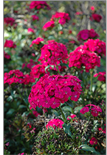
Amazon Neon Cherry Pinks flowers

This is a relatively low maintenance plant, and is best cleaned up in early spring before it resumes active growth for the season. It is a good choice for attracting bees and butterflies to your yard, but is not particularly attractive to deer who tend to leave it alone in favor of tastier treats. It has no significant negative characteristics.