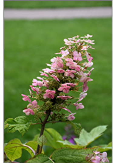
Pee Wee Hydrangea flowers (faded)

Pee Wee Hydrangea makes a fine choice for the outdoor landscape, but it is also well-suited for use in outdoor pots and containers. With its upright habit of growth, it is best suited for use as a 'thriller' in the 'spiller-thriller-filler' container combination; plant it near the center of the pot, surrounded by smaller plants and those that spill over the edges. It is even sizeable enough that it can be grown alone in a suitable container. Note that when grown in a container, it may not perform exactly as indicated on the tag - this is to be expected. Also note that when growing plants in outdoor containers and baskets, they may require more frequent waterings than they would in the yard or garden.