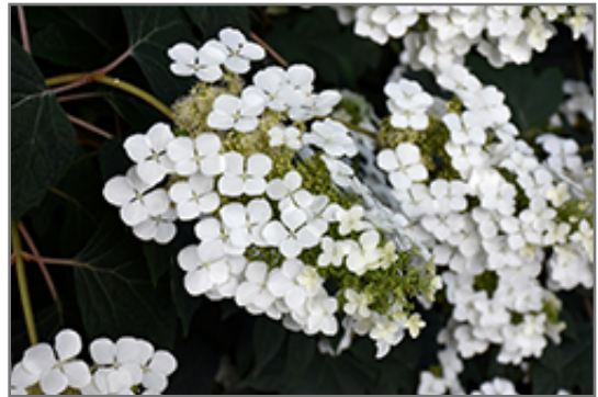
Pee Wee Hydrangea flowers