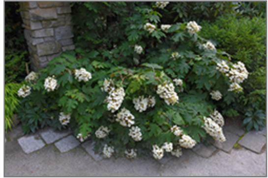
Pee Wee Hydrangea in bloom