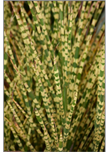
Gold Bar Maiden Grass foliage