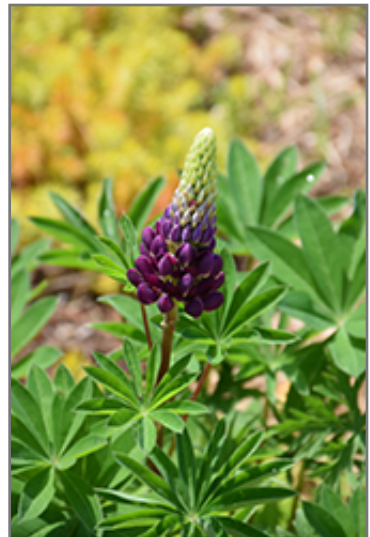
Popsicle Blue Lupine flower buds