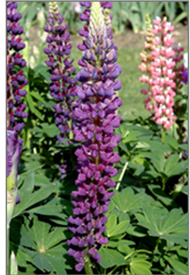
Popsicle Blue Lupine flowers