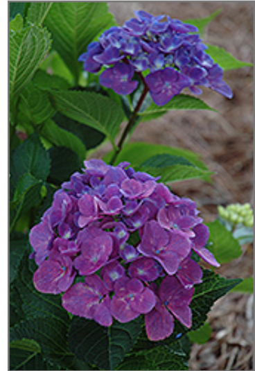
Cityline Venice Dwarf Hydrangea flowers

Cityline Venice Dwarf Hydrangea is recommended for the following landscape applications;