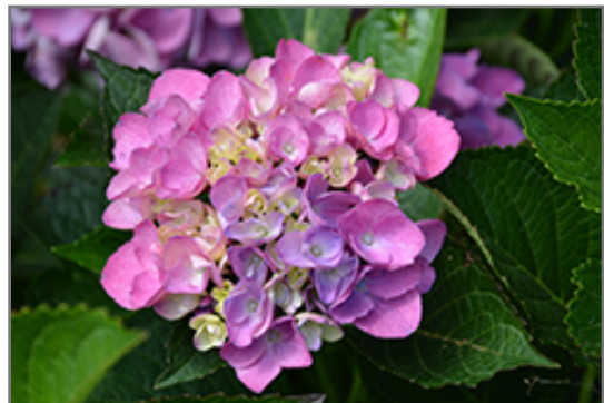
Cityline Venice Dwarf Hydrangea flowers