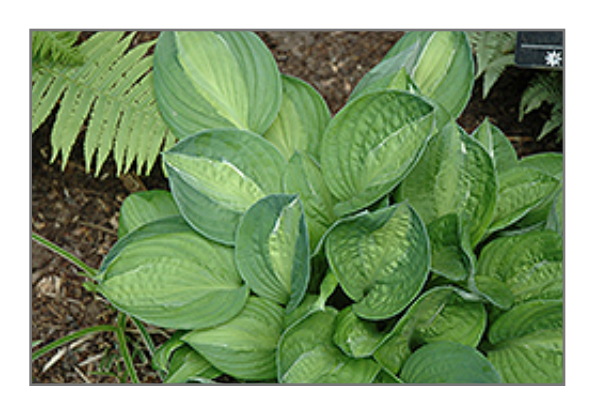
Gypsy Rose Hosta