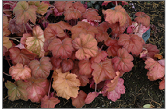
Southern Comfort Coral Bells foliage