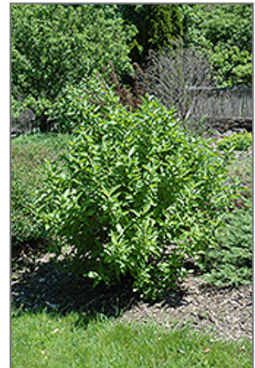
Arctic Fire Red Twig Dogwood