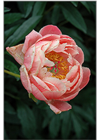
Coral Charm Peony flowers