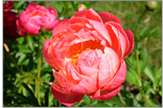
Coral Charm Peony flowers

Coral Charm Peony is recommended for the following landscape applications;